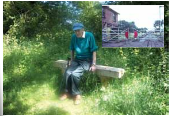
Derrington resident who regularly walks along the Greenway, takes a breather at one of the recently installed community-built benches.

visit www.derringtonvillagehall.btck.co.uk