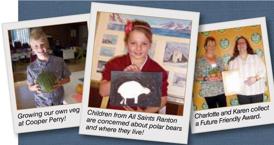
Growing our own veg at Cooper Perry!